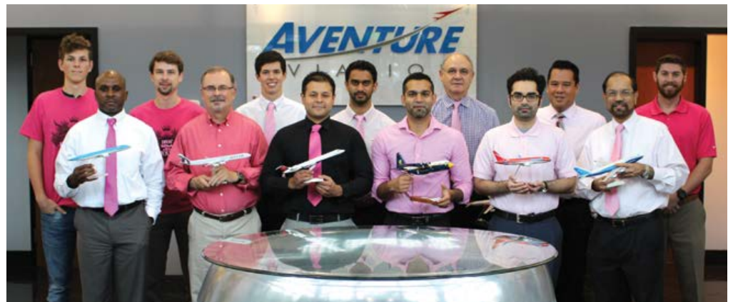
Aventure men proudly wear pink in support of National Breast Cancer Awareness Month.

Community leaders in the Greater Atlanta region, including the President of Aventure Aviation, have joined the hospital's annual "Real Men Wear Pink" campaign. They participated in community events throughout October, with ads appearing in local media.